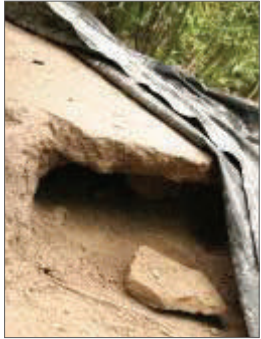
washout under house foundation