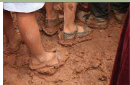
waiting in the mud