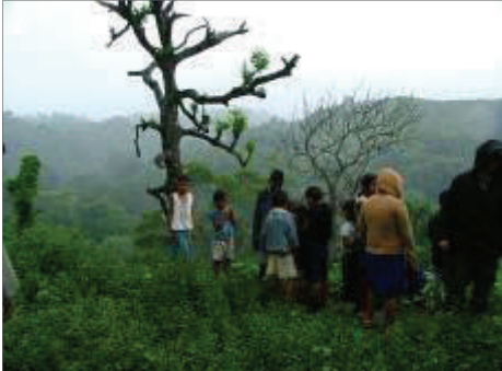
el tinteral community members

In the community of Abelines, the health committee is responding to an increase in infant and elderly illnesses and some houses dangerously close to collapsing due to the persistent weather.