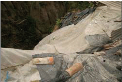
mudslide in las delicias

In the communities of Las Delicias, El Tinteral and San Jose El Naranjo the churches and communities are hard at work repairing houses, roads, bridges water systems and even damaged agricultural areas. In addition, risk mitigation projects have been identified in El Tinteral and Las Delicias where church and community members will be constructing more retaining walls and terracing in strategic areas to prevent damage during future storms.